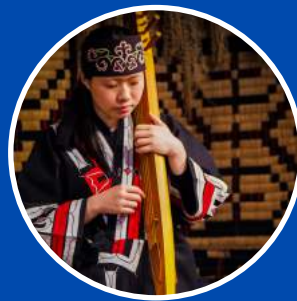
National Ainu Museum Newly opened in 2020!