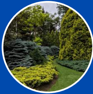
Manabe Conifer Garden