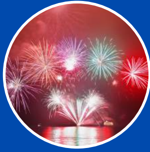
Lake Toya fireworks show