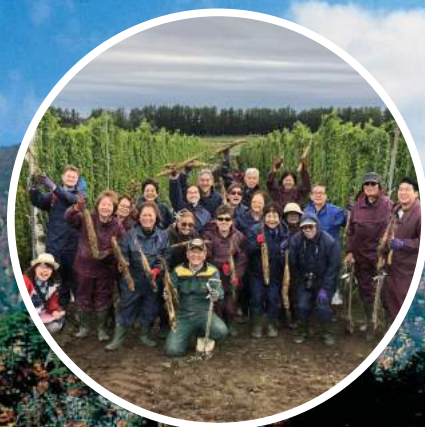
Tokachi farm harvest experience