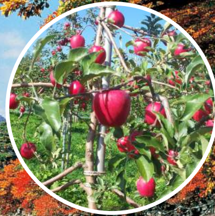
Aomori apple picking

TEL: 808-922-2211 HNL.OUTBOUND@HIS-WORLD.COM