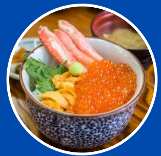
Hakodate morning seafood market