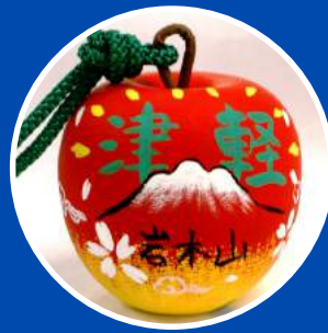
Tsugaru craft-making experience