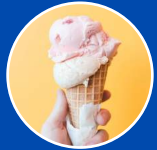
Ice cream-making experience