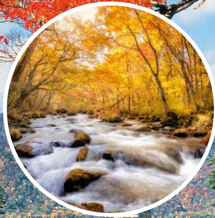
Oirase Stream foliage