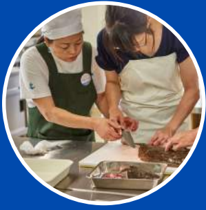
Fisherman's Wife cooking class