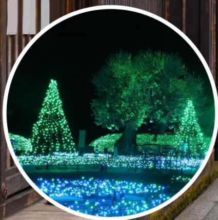
Nabana no Sato Winter Illumination