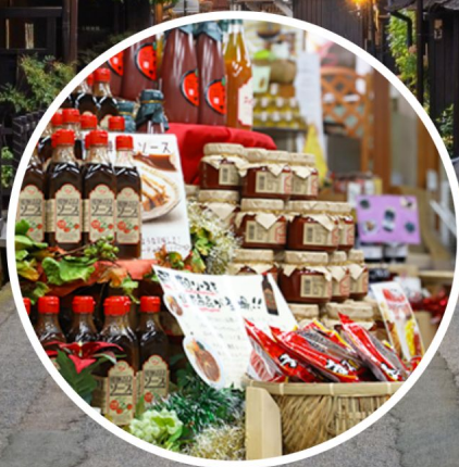
Michi no Eki local specialty shopping