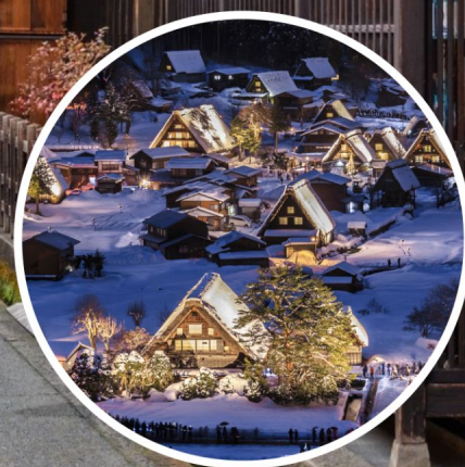
Shirakawa-go Village World Heritage site