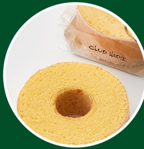
La Collina Baumkuchen confectionary