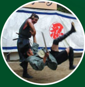
Iga Ninja Museum and demonstration