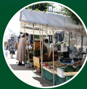
Takayama Morning Market