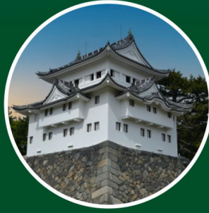
Nagoya Castle and shopping district