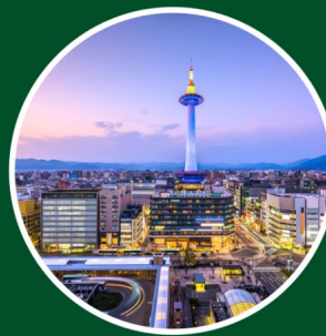
Free day for shopping in Kyoto