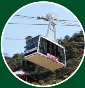
Mt. Kinka Ropeway and Gifu Castle

6 nights hotel - 15 memorable meals - Onsen (hot springs) - WiFi router Unique activities & experiences - and much more!