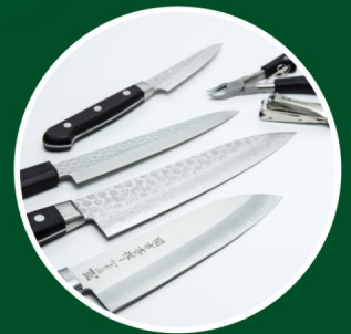
Artisan metalworks and katana performance