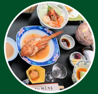
Deluxe kaiseki dinner