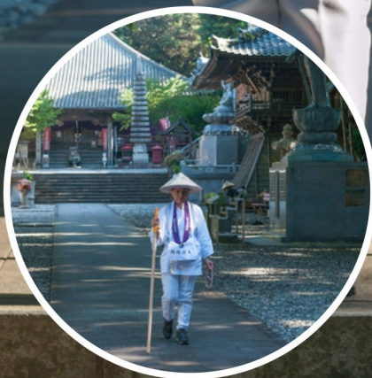
Shikoku Pilgrimage "Henro" experience