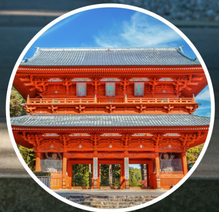
Sacred Mt. Koya World Heritage site

TEL: 808-922-2211 HNL.OUTBOUND@HIS-WORLD.COM