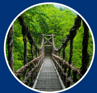
Iya Valley "Kazurabashi" vine bridge sightseeing