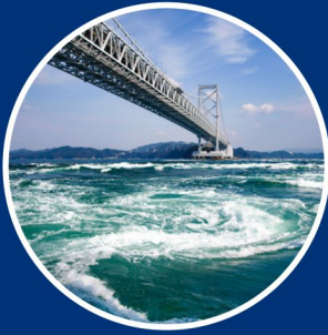
Naruto Whirlpools boat cruise