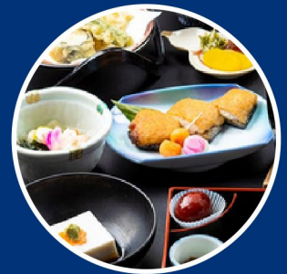
"Shojin Ryori" Buddhist cuisine experience