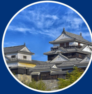
Matsuyama Castle and ropeway ride