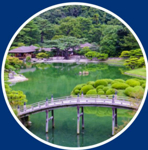
Ritsurin Koen Japanese Garden

9 nights hotel - 23 memorable meals - Onsen (hot springs) - WiFi router Airport lounge - Unique activities & experiences - and much more!