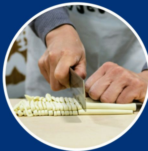
Udon making hands-on experience