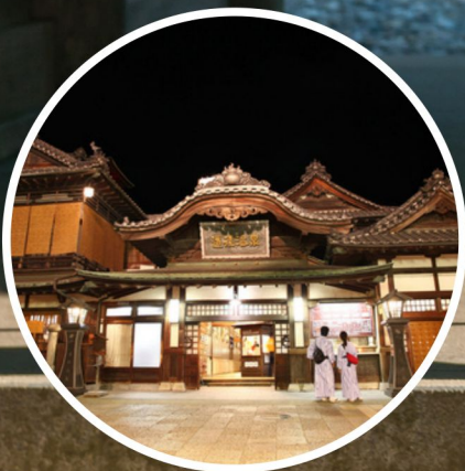
Dogo Onsen Inspiration for Ghibli's "Spirited Away"

9 NIGHTS / 10 DAYS IN JAPAN MAY 21 - MAY 31, 2024