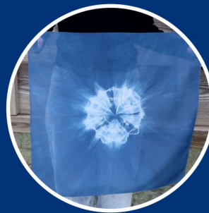
"Aizome" indigo dyeing experience