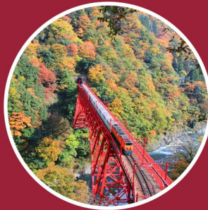
Kurobe Gorge Torokko Train