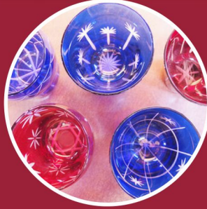
Edo Kiriko Glass hands-on experience