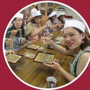
Soba making hands-on experience