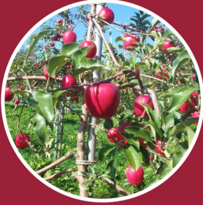
Apple picking in Nagano