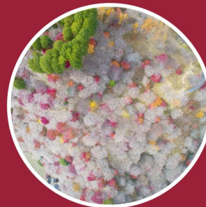
Obara Shikizakura Autumn Sakura festival