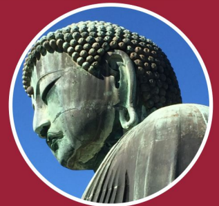
Kamakura Great Buddha