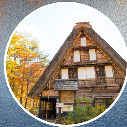
Shirakawa-go World Heritage village

TEL: 808-922-2211 HNL.OUTBOUND@HIS-WORLD.COM