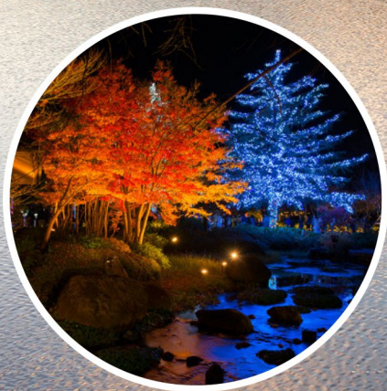
Nabana no Sato autumn illumination

9 NIGHTS / 10 DAYS NOV 11 - NOV 21, 2024