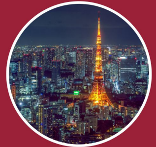
Free day to explore Tokyo!