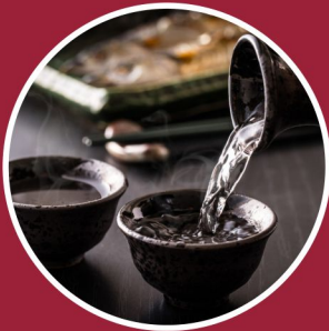
Traditional sake brewery tour

9 nights hotel - 23 meals - Onsen (hot springs) - WiFi router Unique activities & experiences - and much more!