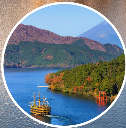
Hakone Lake Ashi "pirate ship" cruise