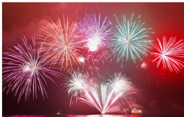
Lake Toya Fireworks Show