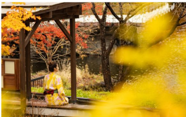
Hoshino Resorts - Aomoriya