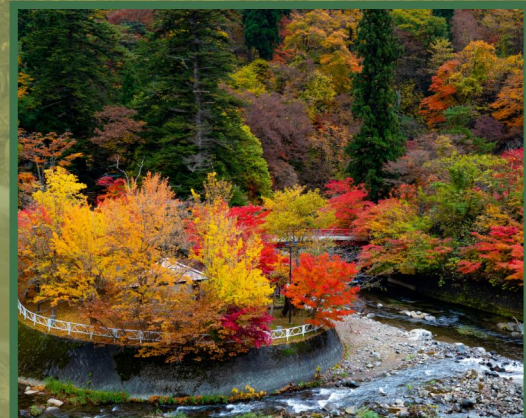
Nakano Momiji-yama (Maple Tree Mountain)