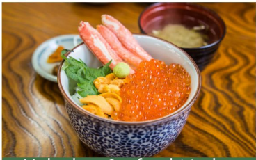
Hakodate Seafood Market