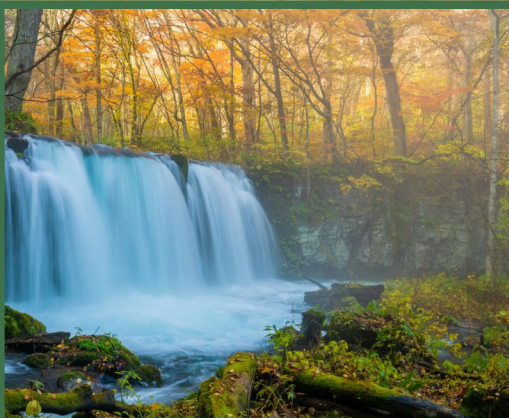
Choshi Otaki Waterfall at Oirase Gorge

*Use miles or fly your favorite airline!