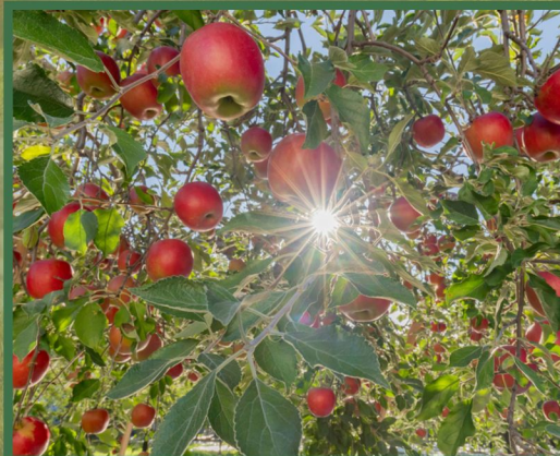
Aomori Apple Picking