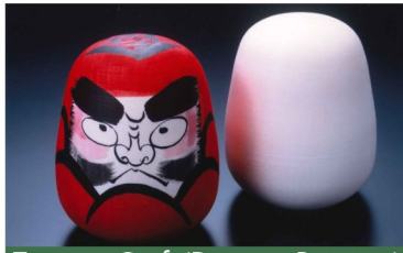
Tsugaru Craft (Daruma Painting)