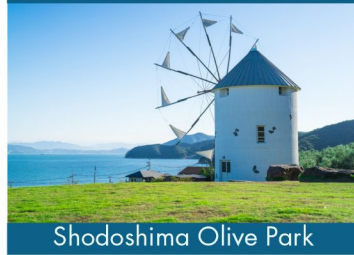
Shodoshima Olive Park