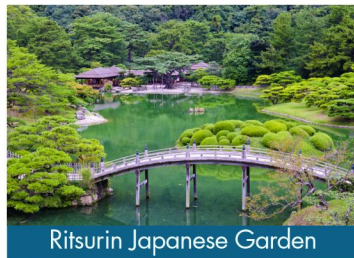
Ritsurin Japanese Garden