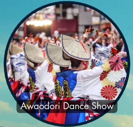
Awaodori Dance Show