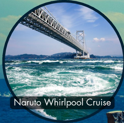
Naruto Whirlpool Cruise