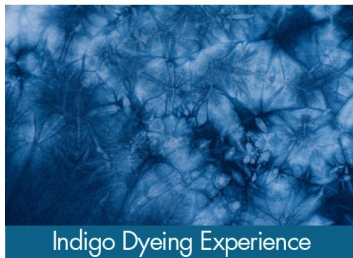
Indigo Dyeing Experience