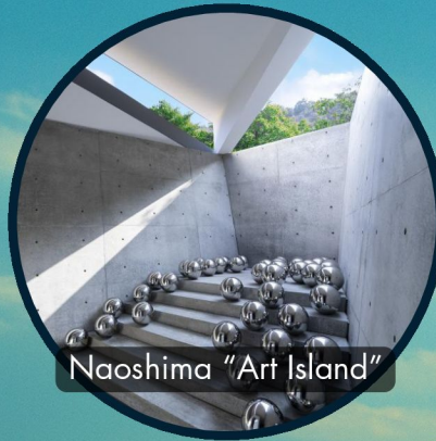
Naoshima "Art Island"

Featuring artworks from the Setouchi Art Triennale