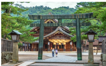
Izumo Grand Shrine