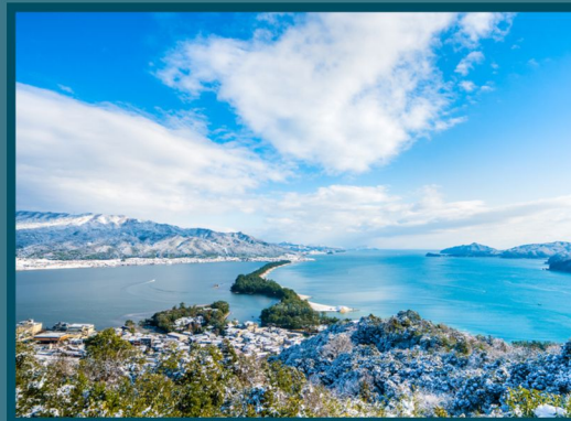
Ama no Hashidate "Bridge to Heaven"