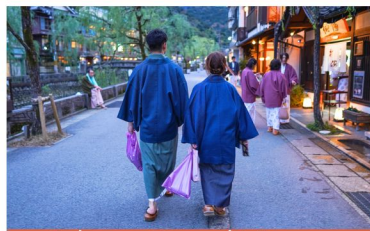
Relax at Kinosaki Onsen