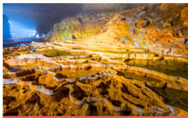
Akiyoshido Limestone Cave