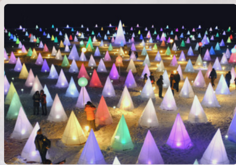
Sairinka Ice Flower Festival