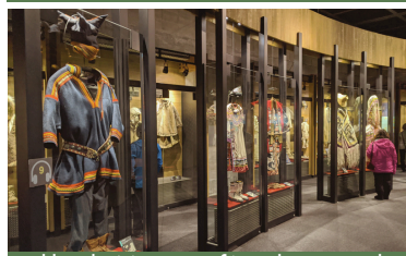
Hokkaido Museum of Northern Peoples