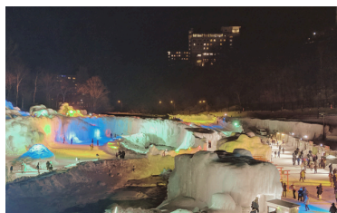
Sounkyo Ice Festival