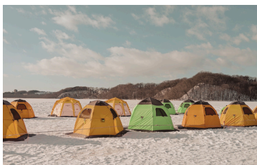
Lake Abashiri Smelt Fishing