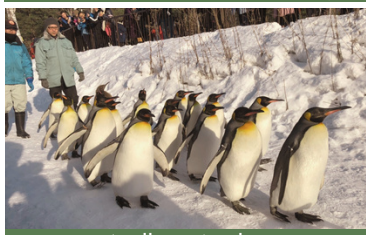
Penguin Walk at Asahiyama Zoo