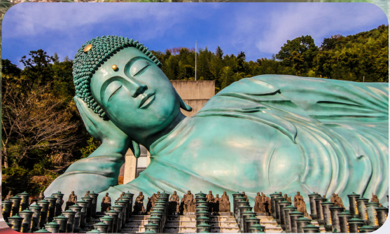
Nanzoin Temple Reclining Buddha