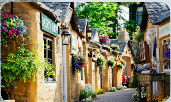
Yufuin Floral Village