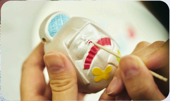
Hakata Doll Painting