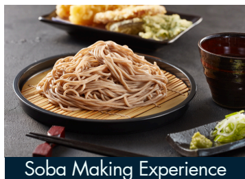
Soba Making Experience