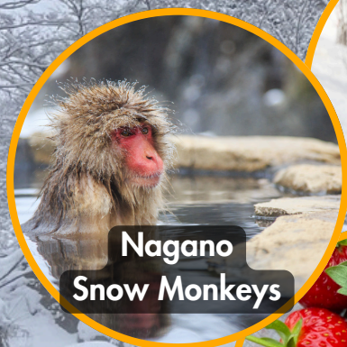
Nagano Snow Monkeys

9 NIGHTS / 10 DAYS IN JAPAN JANUARY 10 – 20, 2026