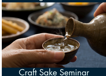
Craft Sake Seminar