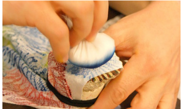
Coral Dyeing Experience