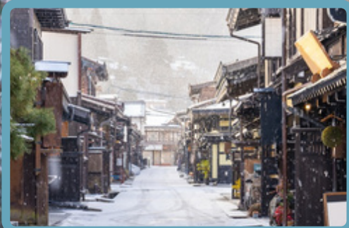
Snowy Streets of Old Town Takayama