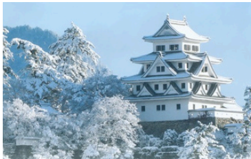
Gujo Hachiman Castle