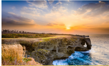
Sunset at Cape Manzamo