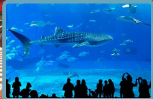
Okinawa Churaumi Aquarium