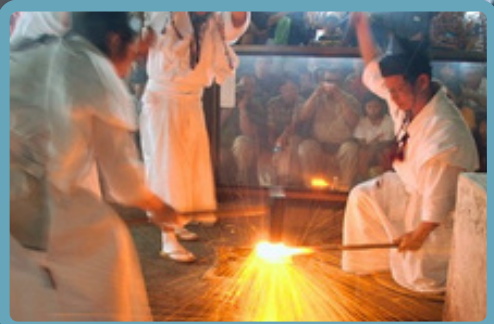
Seki Katanakaji Demonstration

*Use miles or fly your favorite airline or business class!