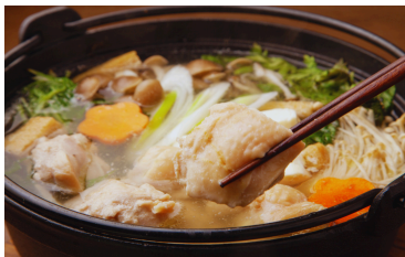
Mizutaki Hot Pot