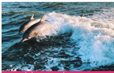
Dolphin Watching Cruise