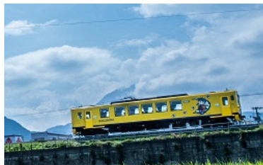
Shimaetsu Cafe Train