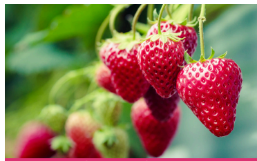
Strawberry Picking Activity