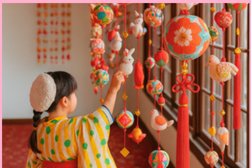
Sagemon Doll Festival

*Use miles or fly your favorite airline or business class!