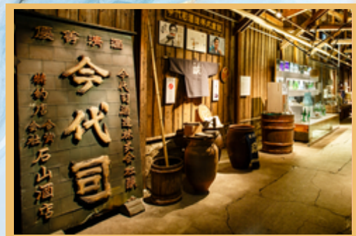
Sake Brewery Tours