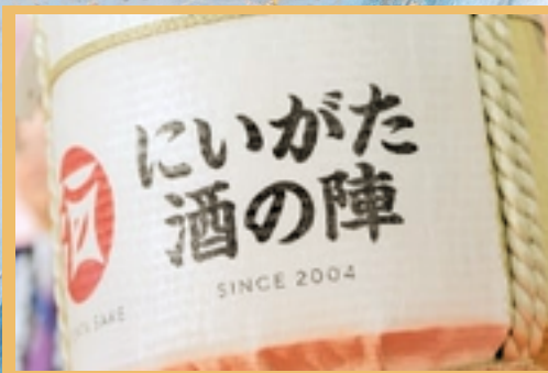
Niigata Sake no Jin Festival