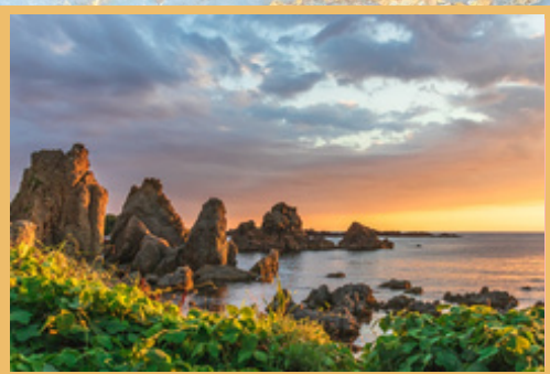
Sunset at Sado Island

*Use miles or fly your favorite airline or business class!