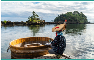
Tub Boat 'Tarai Bune'