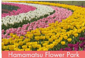
Hamamatsu Flower Park