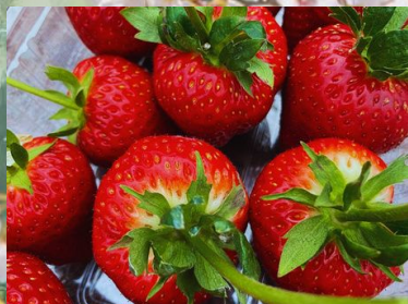
LOCAL STRAWBERRY PICKING