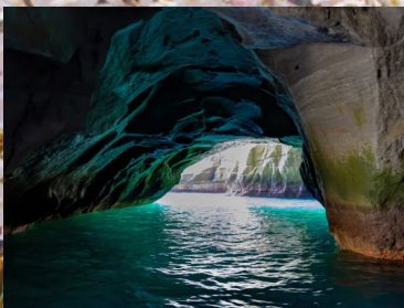
DOGASHIMA CAVE CRUISE