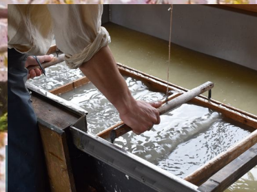
WASHI PAPER EXPERIENCE