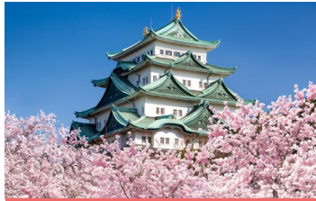
Sakura at Nagoya Castle