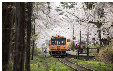
Ashino Park sakura and local train