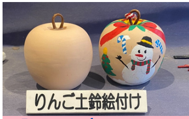
Tsugaru crafts experience