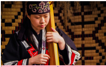
Upopoy National Ainu Museum