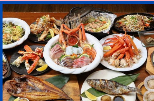
King Crab Deluxe Kaiseki Dinner