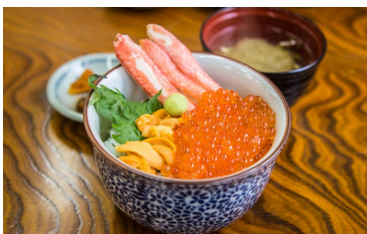
Hakodate Morning Market