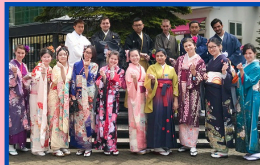
Traditional Kimono Rental Experience