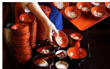
Wanko Soba Lunch