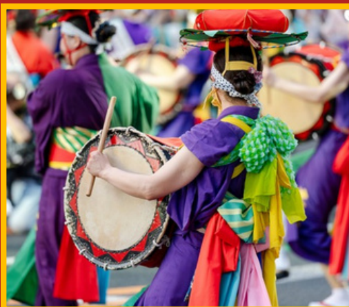
Morioka Sansa Odori Festival