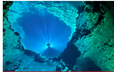
Ryusendo Cave - Iwate