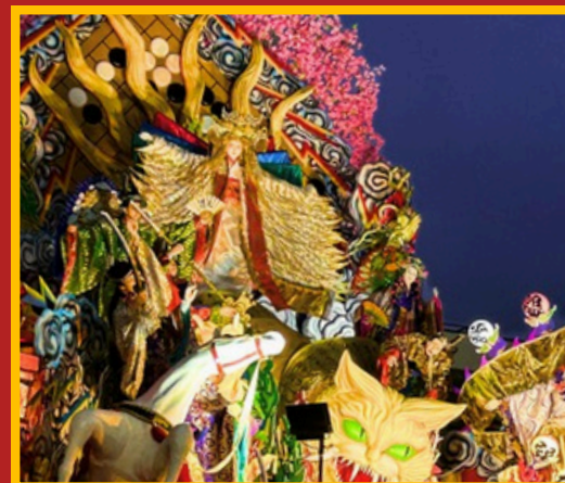
Hachinohe Sansha Taisai