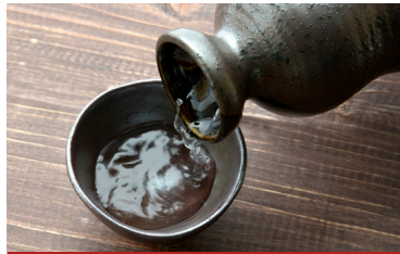
Sake Brewery Tastings