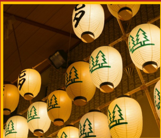
Akita Kanto Festival

EXPERIENCE FOUR MAJOR MATSURI, INCLUDING AOMORI'S FAMOUS NEBUTA FESTIVAL!