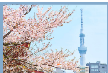
Tokyo Skytree (Tokyo)

Baggage Forwarding (included Tokyo → Kyoto)