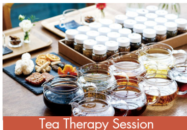
Tea Therapy Session