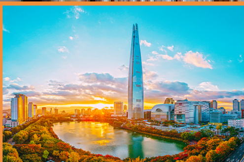
Lotte World Tower Seoul Sky

Experience Korean Healing & Heritage This Autumn Limited to 24 Guests for a Serene Seoul Retreat