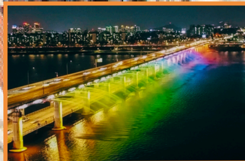
Banpo Bridge Moonlight Rainbow Fountain