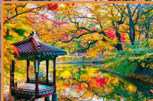
Changdeokgung Secret Garden