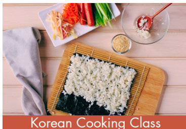
Korean Cooking Class