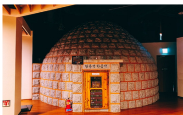
Korean Dry Sauna - Jjimjilbang