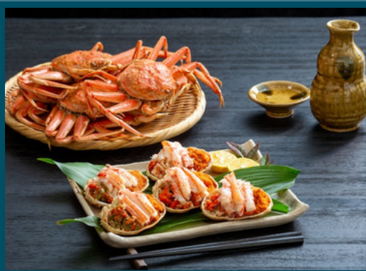
Winter's Best Crab Kaiseki

*Use miles or fly your favorite airline!