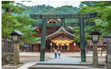
Izumo Grand Shrine