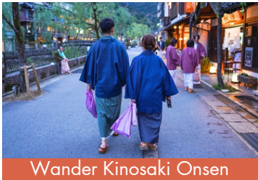
Wander Kinosaki Onsen