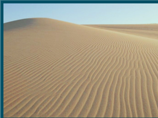
UNESCO Geopark Tottori Sand Dunes