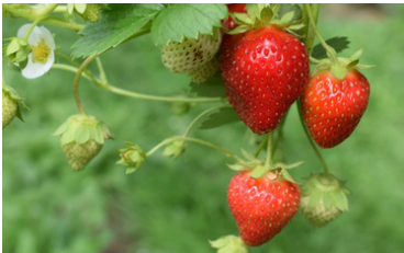
Strawberry Picking experience