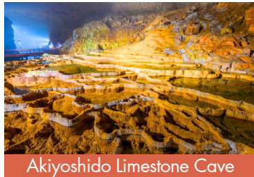
Akiyoshido Limestone Cave