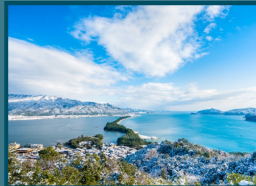
Ama no Hashidate "Bridge to Heaven"