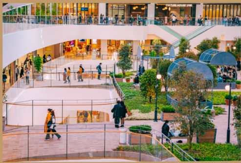
Hyundai Department The Hyundai Seoul

Discover the perfect harmony of vibrant autumn foliage and Korea's latest urban trends through Seoul and Busan