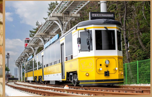
Haeundae Blue Line Park Beach Train