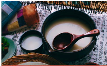
Makgeolli(Rice Wine) Making