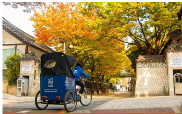
Scenic Rickshaw Ride