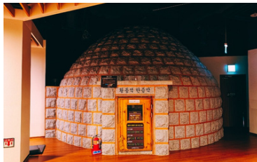
Korean Dry Sauna - Jjimjilbang