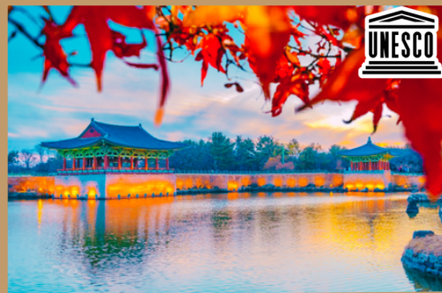
Donggung Palace and Wolji Pond