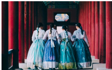
Palace Hanbok Experience