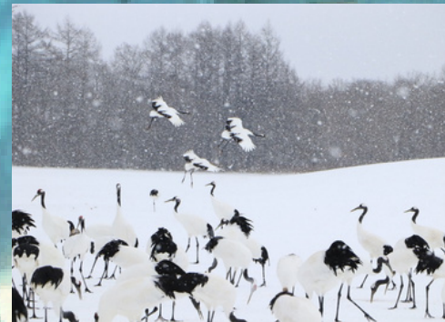
Red-crowned Crane "Tancho" Sanctuary

ASAHIKAWA • SOUNKYO • ABASHIRI • AKAN • TOKACHIGAWA ONSEN • FURANO • OTARU • SAPPORO