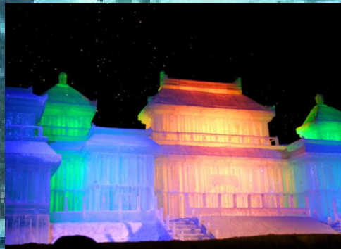
World-famous Sapporo Snow Festival