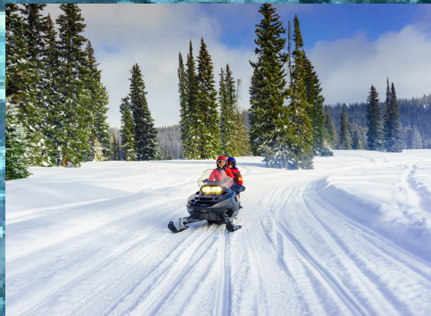
Forest snowmobiling experience

*Use miles or fly your favorite airline or business class!