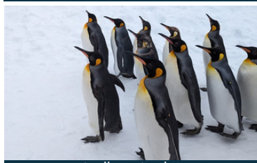
Penguin Walk at Asahiyama Zoo