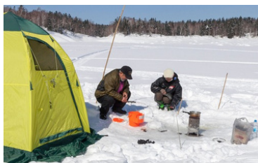
Lake Abashiri Ice Fishing