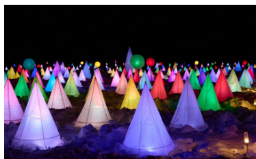
Sairinka "Ice Flower" festival