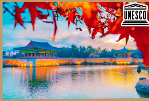
Donggung Palace and Wolji Pond