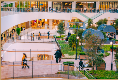
Hyundai Department The Hyundai Seoul

Discover the perfect harmony of vibrant autumn foliage and Korea's latest urban trends through Seoul and Busan