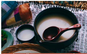
Makgeolli(Rice Wine) Making