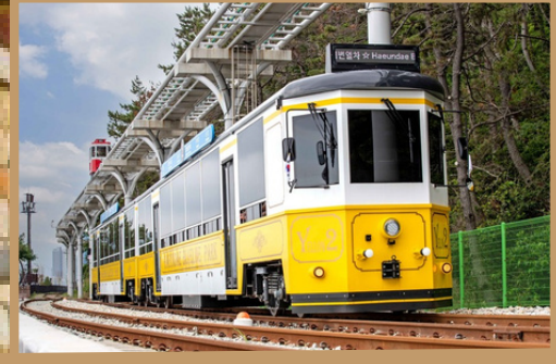
Haeundae Blue Line Park Beach Train