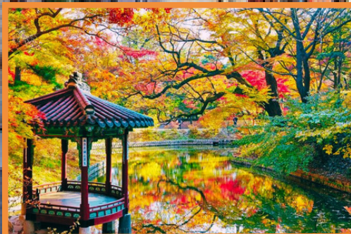
Changdeokgung Secret Garden