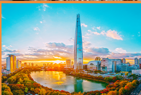
Lotte World Tower Seoul Sky

Experience Korean Healing & Heritage This Autumn Limited to 24 Guests for a Serene Seoul Retreat